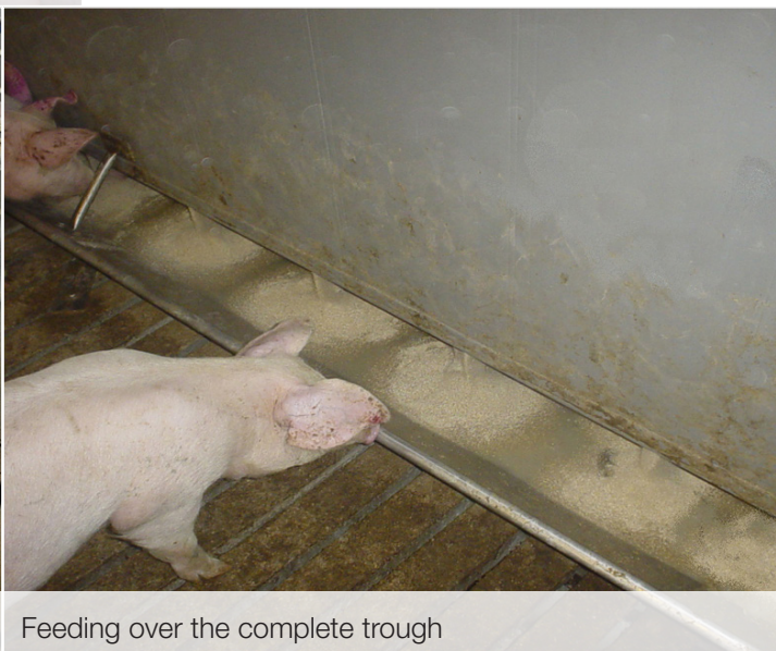
Feeding over the complete trough